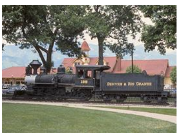
Locomotive #168 on static display in Colorado Springs waiting to be given a new life.

For more information and additional photo images please contact